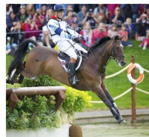
William Fox-Pitt MBE

Boyd Martin, 2 x 5* winner, 2 x Pan Am Gold medalist, 3 x Olympian. Boyd is one of the best US event riders of all time.